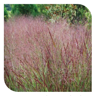
Panicum "Shenandoah" Red Switch Grass (PS)