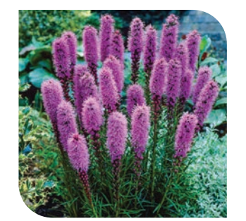
Liatris "Kobold" (LK)