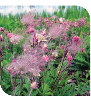
Geum Triflorum "Prairie Smoke"