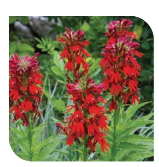
Lobelia Cardinalis (LC)