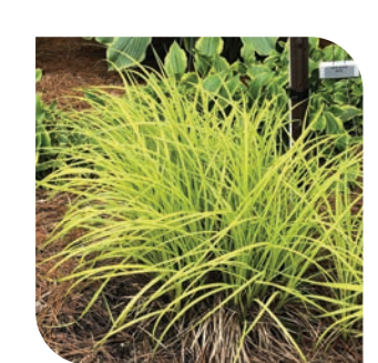
Carex "Bowles Golden" (C)