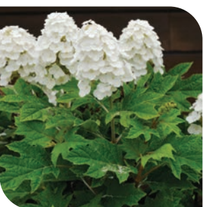
Hydrangea Quercifolia "Alice" (HQ)