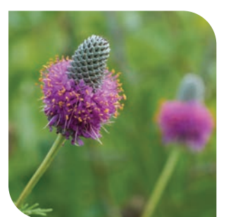
Dalea Purpurea (D)