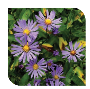
Aster Laevis Smooth Aster