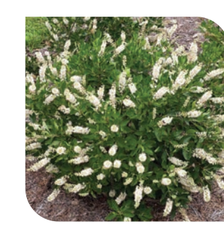
Clethra Alnifolia "Sixteen Candles" (CL)

"A garden to walk in and immensity to dream in what more could he ask? A few flowers at his feet and above him