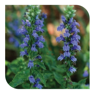
Lobelia Siphilitica (LS)