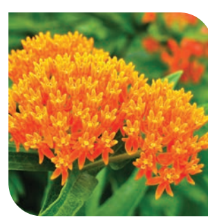
Asclepias Tuberosa Butterfly Weed (AT)