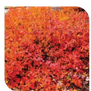
"Grow Low" (RAG)