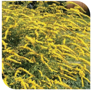
Solidago "Fireworks" (So)