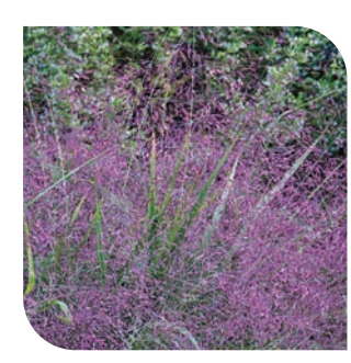
Eragrostis Spectabilis Purple Love Grass (ES)