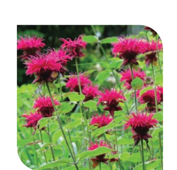
Monarda "Raspberry Wine" (Mo)