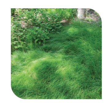
Carex Pensylvanica "Pen Sedge"