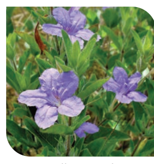
Ruellia Humilis "Wild Petunia"