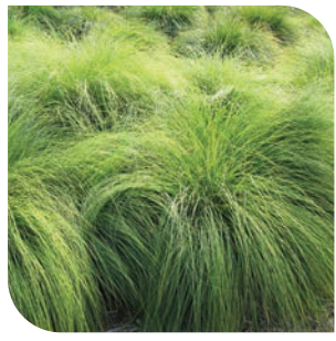
Sporobolus Heterolepis Dropseed (S)