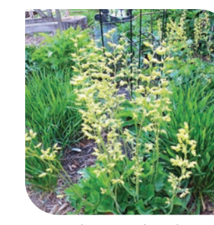
Heuchera Richardsonii "Alumroot"